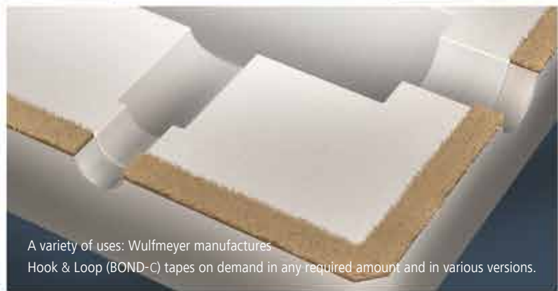
A variety of uses: Wulfmeyer manufactures Hook & Loop (BOND-C) tapes on demand in any required amount and in various versions.

The founder of Wulfmeyer Aircraft Interior, Rudolf Wulfmeyer, was requested in 1958 by a German aircraft industry division, now known as Airbus, to develop a self-adhesive version for the hook & loop tape used at that time. This was the starting point of what later became „Bond-C“, Wulfmeyer’s hook & loop tape product in non and self-adhesive versions and in accordance with ABS1236.